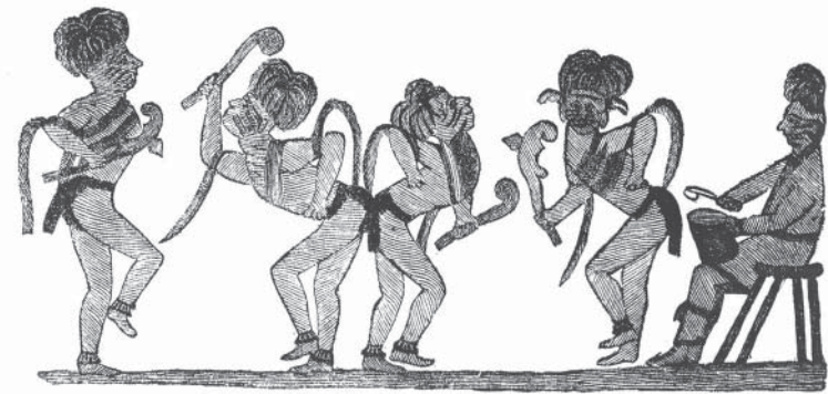
A WAR DANCE

In the reign the King Atotarho VIII, perhaps 450 years before Columbus discovered the America. About this time the Twakanhah or Messissaugers began to wage a war against the five nations ; the Senecas on the frontier were most engaged in the warfare. After various skirmishes the enemy was so excited that they determined to destroy the fort Kauhanauka, (now in Tuscarora near Lewiston,) but the commander of the fort was aware of the danger, he sent messengers to the forts in the vicinity, and about eight hundred warriors were collected at fort Kauhanauka. The commander had sent runners to observe the movements of the enemy. The army marched towards the river, and hid themselves among the bushes under the mountain ; the enemy came up ; a bloody battle ensued ; the enemy was repulsed and flies from the foe. The army retired to the fort ; soon after the commander dispatched two runners to the forts on the Genesee river to procure assistance as soon as possible ; the army received reinforcements ; they made bark canoes and carried them to the mouth of the Niagara river ; the canoes were ready, the commander sent a chieftain and offered the enemy an intermission of parley, but the proposal was not accepted ; the army immediately crossed the river and made vigorous attack : the enemy was routed