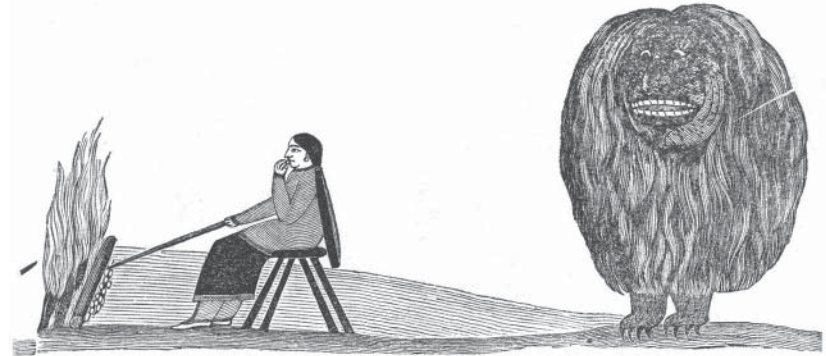
THE FLYING HEAD PUT TO FLIGHT BY A WOMAN PARCHING ACORNS.

About one hundred winters since the people left the mountain,—the five families were increased, and made some villages